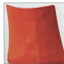
Faceted Outer Side