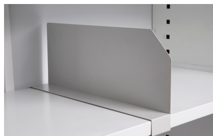
GSD6 Clip On Divider