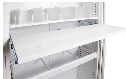
GG09PS Roll Out File Shelf