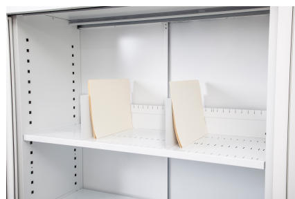
GG09SLOT Slotted Shelf + GS7D Dividers