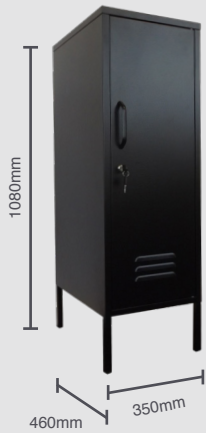
1080H MINI LOCKER