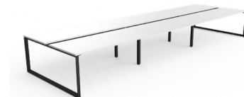
Anvil 6 User Double Sided Desk