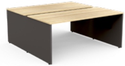
EkoSystem Double Sided Desk