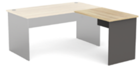
EkoSystem Desk & Return