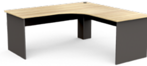
EkoSystem 90° Workstation