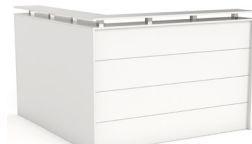
Axis Corner Reception with Pop-top