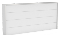
Axis Straight Reception without Pop-top