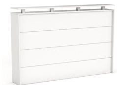
Axis Straight Reception with Pop-top