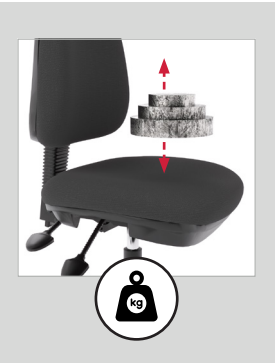
C. Strong & Durable High strength components produce a 160kg weight rating.