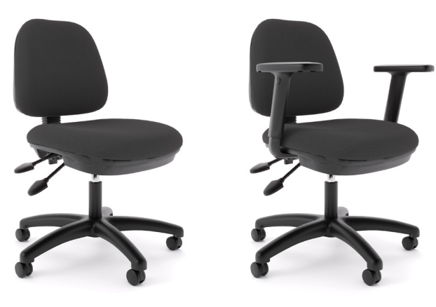
Evo Chair No Arms